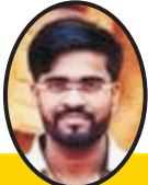
DEBDUL BAG REG. ID: 51 TIFR-GS-2021-SELECTED (TIFR MUMBAI)