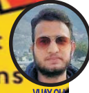
VIJAY CH GATE-CY-2022 AIR-254 (Reg. ID-930) ONGC SELECTED 2022