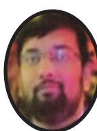
KRISHNA PANJA GATE 2020 AIR 1 ONGC/UPSC GSI/DRDO 2020-21 SELECTED-AIR 4 REG. ID: KP@2020